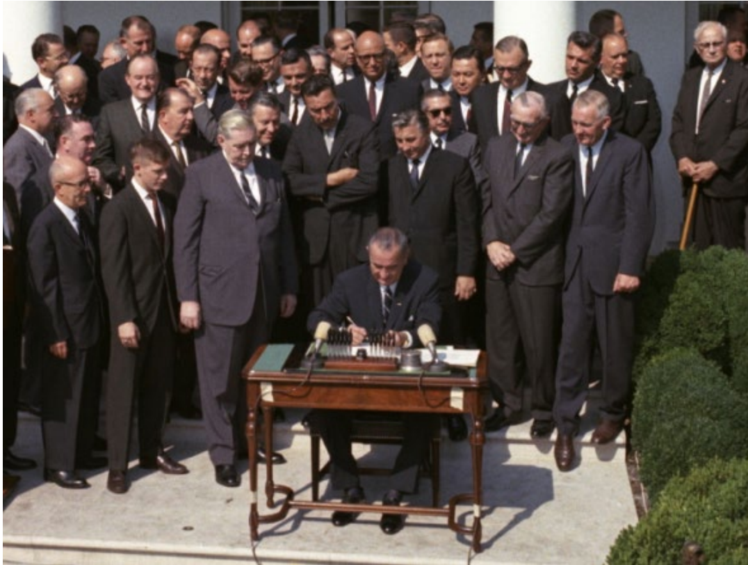
Johnson signing the Economic Opportunity Act

President Lyndon Johnson signed two landmark laws 60 years ago this summer: