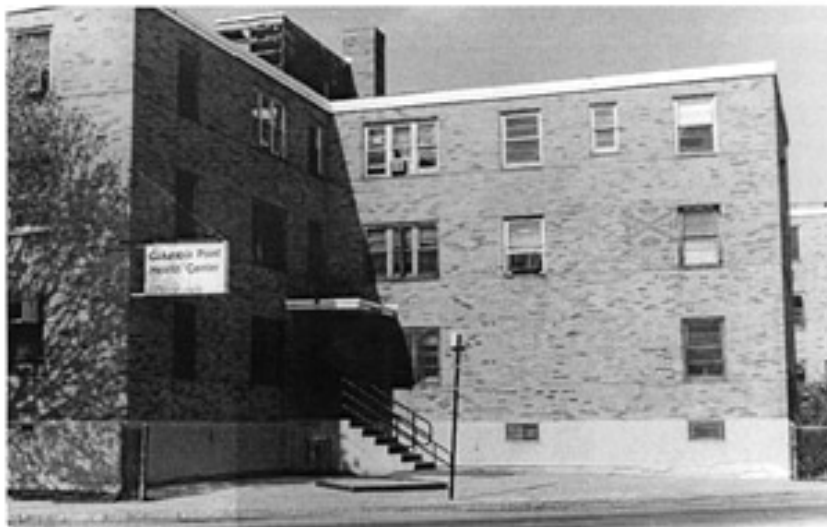
Left: Columbia Point Health Center